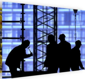
Projets & Services Industriels