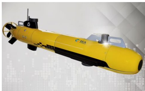
Smart Safety Systems