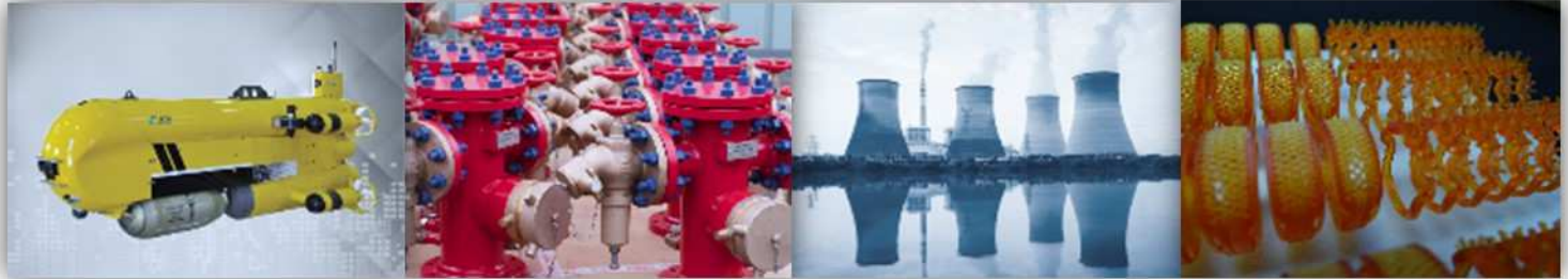
Smart Safety Systems