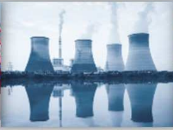
Protection in Nuclear Environments