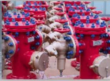
Industrial Projects &amp; Services