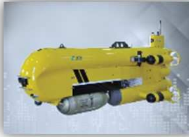
Smart Safety Systems