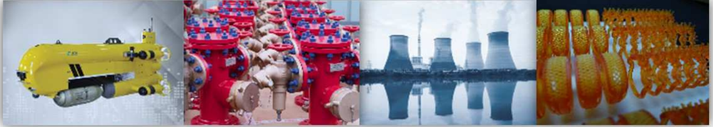
Smart Safety Systems