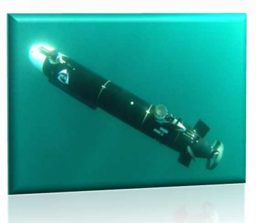
Smart Safety Systems