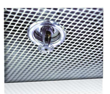
Industrial and Projects Services