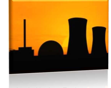
Protection in Nuclear Environments