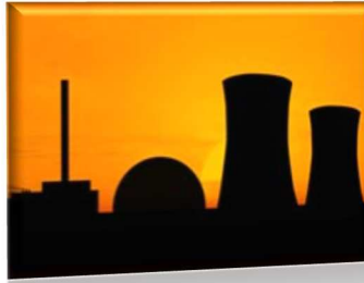
Protection in Nuclear Environments