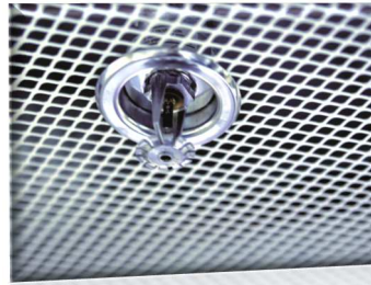
Industrial and Projects Services