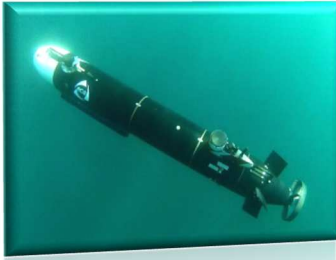
Smart Safety Systems