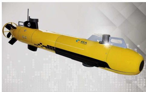
Smart Safety Systems