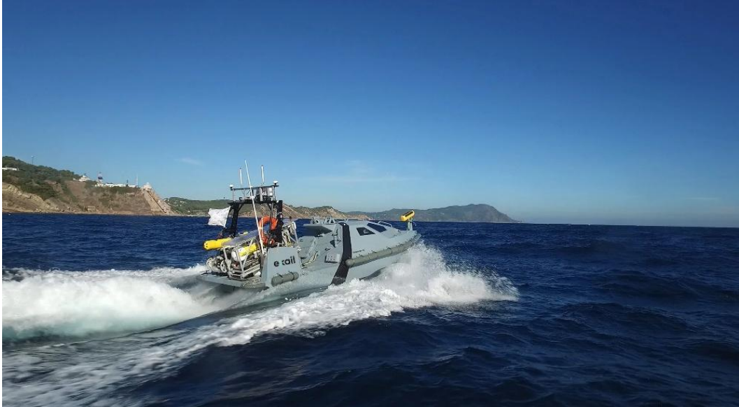
Surface drone USV Inspector 90 and its Launch & Recovery system